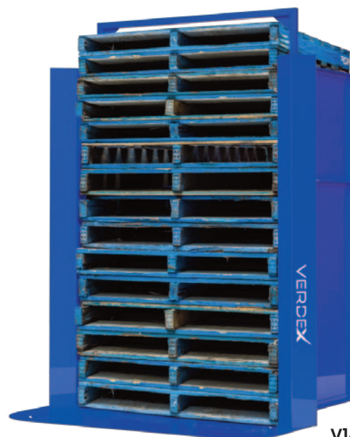
V1495 pictured with Pallets