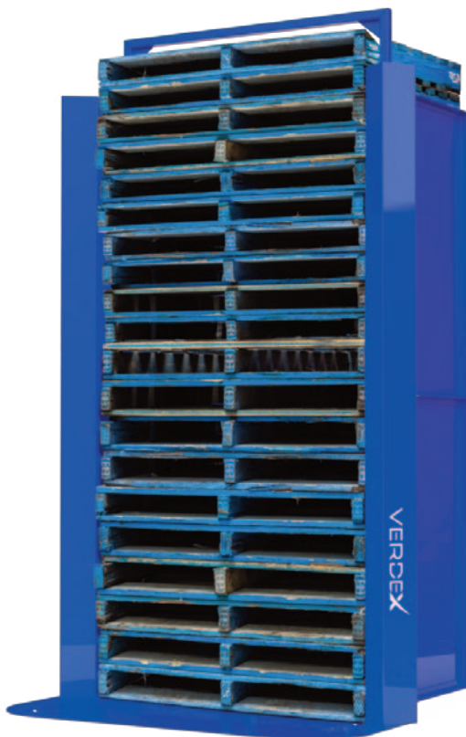
V1496 pictured with Pallets