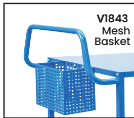
V1843 Mesh Basket