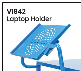
V1842 Laptop Holder