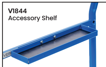
V1844 Accessory Shelf