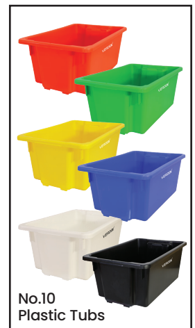
No.10 Plastic Tubs