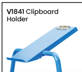
V1841 Clipboard Holder