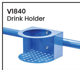
V1840 Drink Holder