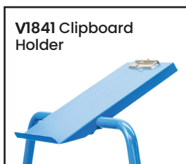
V1841 Clipboard Holder