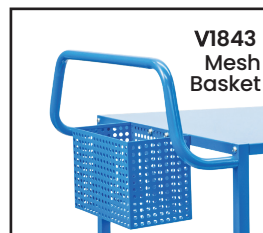
V1843 Mesh Basket