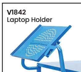
V1842 Laptop Holder