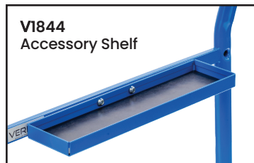
V1844 Accessory Shelf