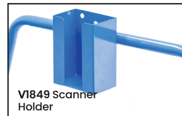
V1849 Scanner Holder