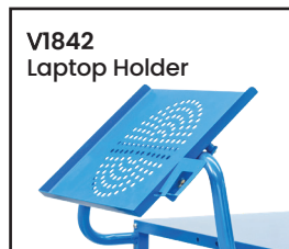
V1842 Laptop Holder