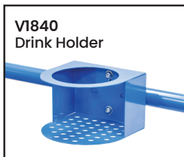
V1840 Drink Holder