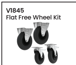
V1845 Flat Free Wheel Kit