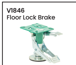
V1846 Floor Lock Brake