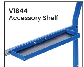
V1844 Accessory Shelf