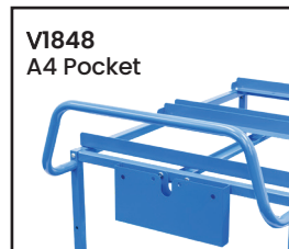
V1848 A4 Pocket