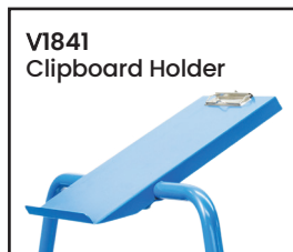
V1841 Clipboard Holder