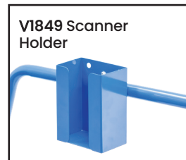
V1849 Scanner Holder