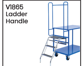
V1865 Ladder Handle