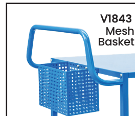
V1843 Mesh Basket