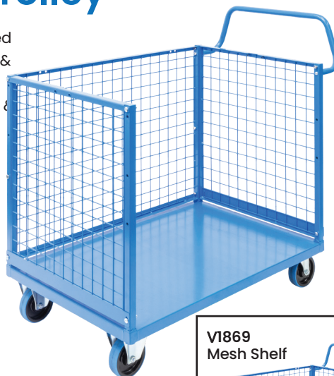
V1869 Mesh Shelf