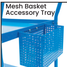
Mesh Basket Accessory Tray