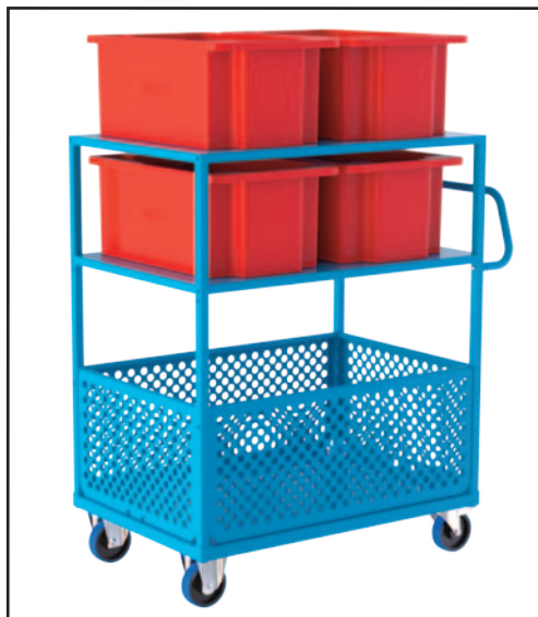
Accessory Shelf Unit