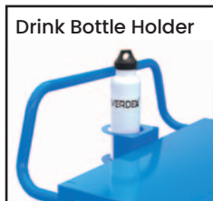
Drink Bottle Holder