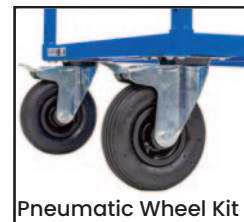
Pneumatic Wheel Kit