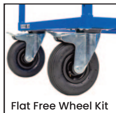
Flat Free Wheel Kit