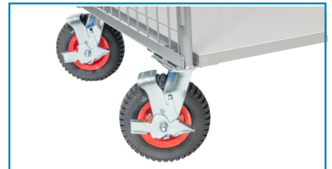
V1055 – Flat Free Wheel Kit