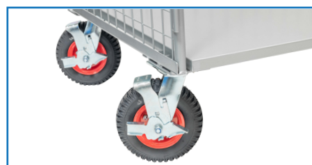
V1055 – Flat Free Wheel Kit