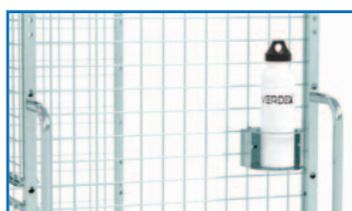
V1840Z – Drink Holder