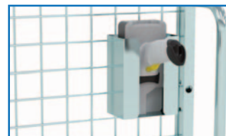
V1849Z – Scanner Holder