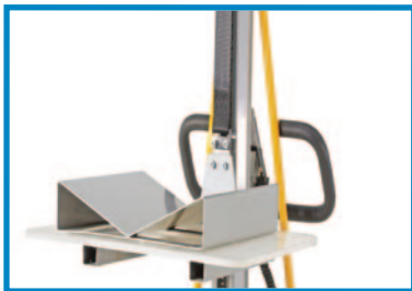
V Block Attachment