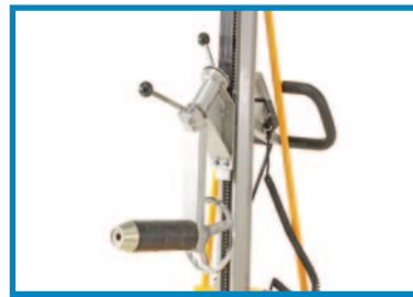
Reel Handler Rotator Attachment