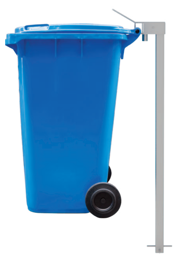
V6384 can be fixed in concrete or mounted below the ground's surface