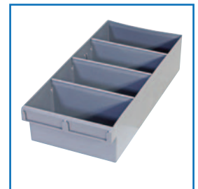
IH-025 Parts Trays Size LxWxH: 400x200x100mm (with 3 dividers)