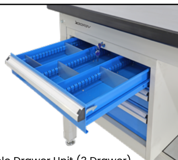
V7312 Lockable Drawer Unit (3 Drawer) to suit the Workbenches 565x650x450mm (WxDxH)