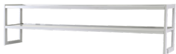
V7254 & V7255 2 Tier Shelf to suit Workbenches (available in 1800mm & 2100mm length)