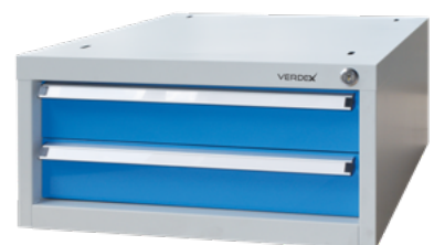
V7244 Lockable Drawer Unit (2 Drawer) to suit the Workbenches 565x580x280mm (WxDxH)