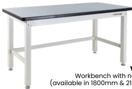
V7240 & V7242 Workbench with no bottom shelf (available in 1800mm & 2100mm length)