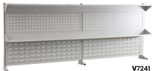
V7241 & V7243 Back panel set to suit Workbenches (available in 1735mm & 2035mm length)