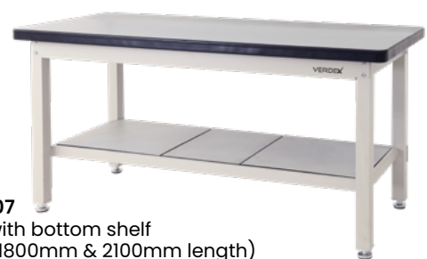
V7306 & V7307 Workbench with bottom shelf (available in 1800mm & 2100mm length)