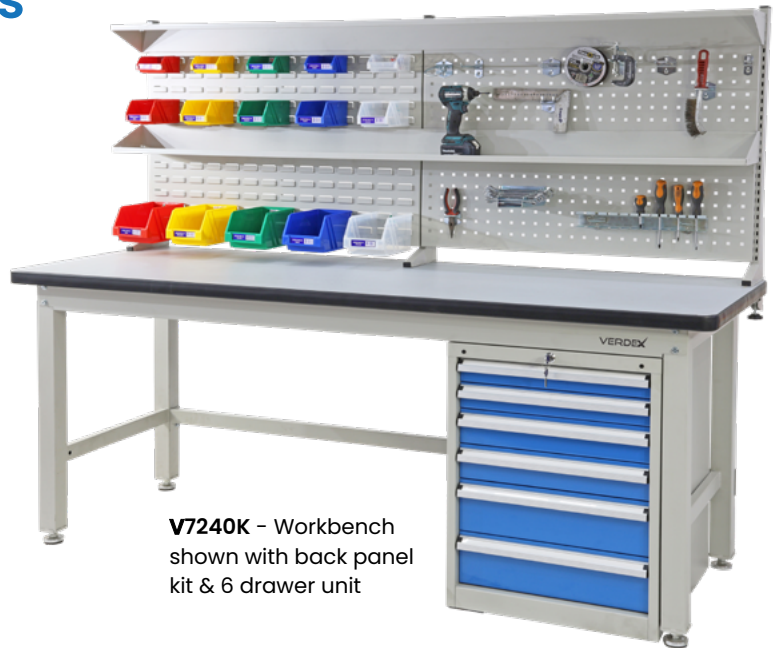
V7240K - Workbench shown with back panel kit & 6 drawer unit