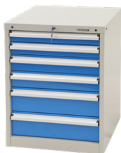
V7245 6 Drawer Unit to suit Workbenches 565x580x750 (WxDxH)