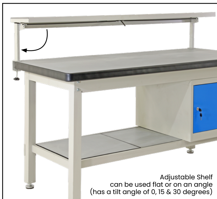
Adjustable Shelf can be used flat or on an angle (has a tilt angle of 0, 15 & 30 degrees)