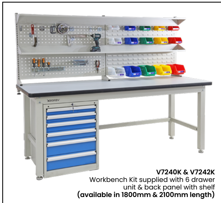
V7240K & V7242K Workbench Kit supplied with 6 drawer unit & back panel with shelf (available in 1800mm & 2100mm length)