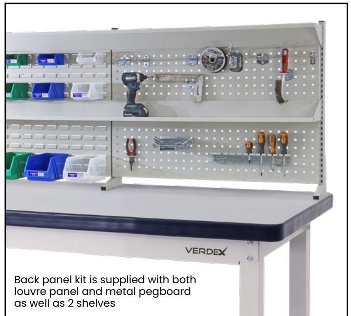
Back panel kit is supplied with both louvre panel and metal pegboard as well as 2 shelves