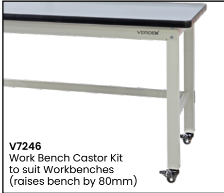
V7246 Work Bench Castor Kit to suit Workbenches (raises bench by 80mm)