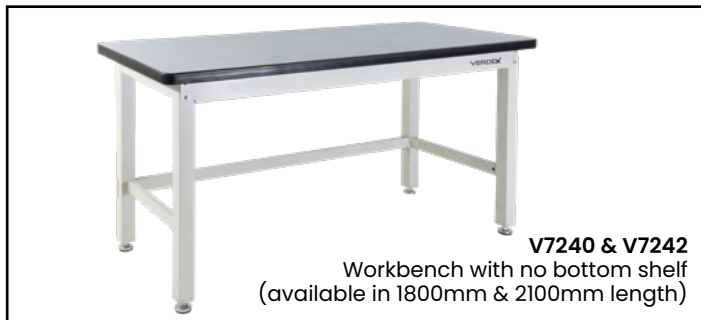
V7240 & V7242 Workbench with no bottom shelf (available in 1800mm & 2100mm length)