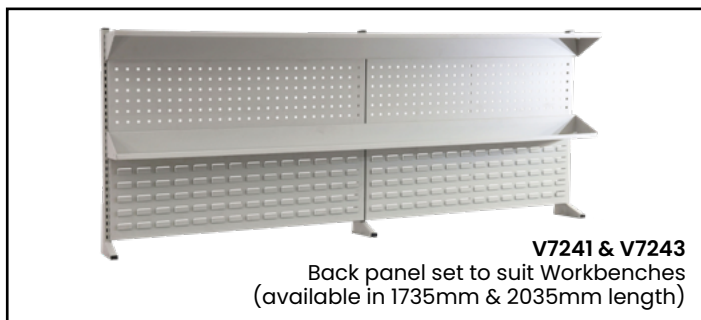
V7241 & V7243 Back panel set to suit Workbenches (available in 1735mm & 2035mm length)