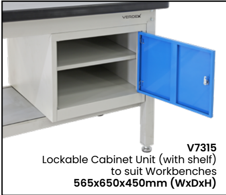
V7315 Lockable Cabinet Unit (with shelf) to suit Workbenches 565x650x450mm (WxDxH)