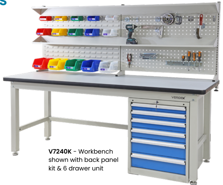
V7240K - Workbench shown with back panel kit & 6 drawer unit