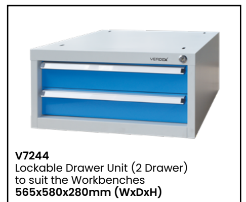
V7244 Lockable Drawer Unit (2 Drawer) to suit the Workbenches 565x580x280mm (WxDxH)