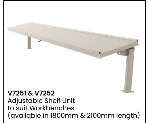
V7251 & V7252 Adjustable Shelf Unit to suit Workbenches (available in 1800mm & 2100mm length)