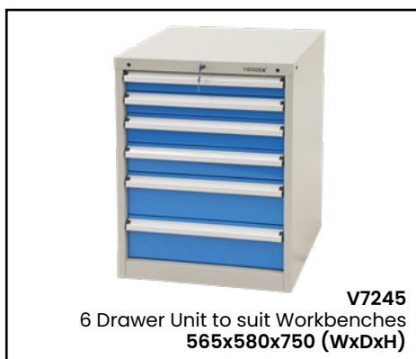
V7245 6 Drawer Unit to suit Workbenches 565x580x750 (WxDxH)