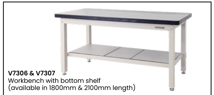
V7306 & V7307 Workbench with bottom shelf (available in 1800mm & 2100mm length)