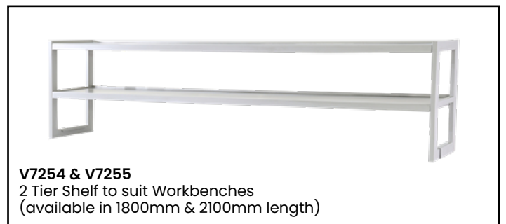
V7254 & V7255 2 Tier Shelf to suit Workbenches (available in 1800mm & 2100mm length)