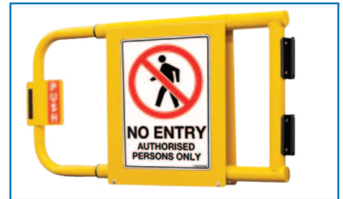
V7477 pictured with safety signs