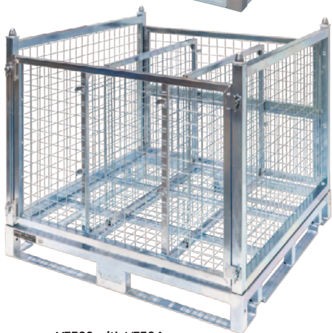
V7530 with V7534