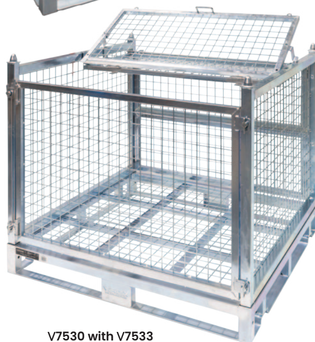
V7530 with V7533