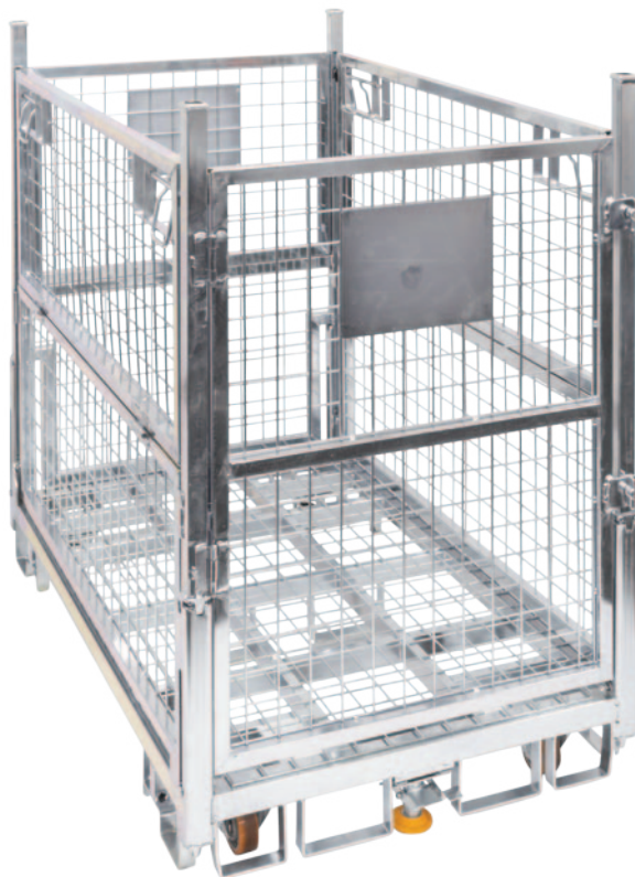
Pictured with V7562