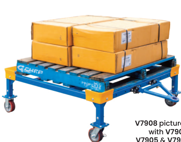
V7908 pictured with V7903, V7905 & V7907