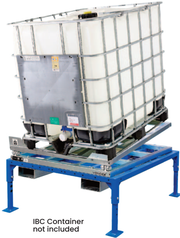
IBC Container not included