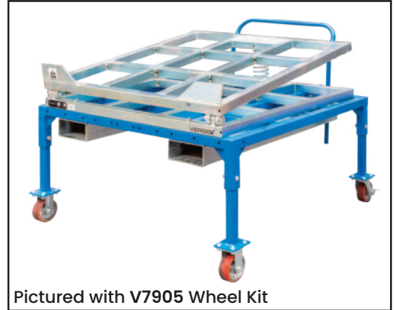
Pictured with V7905 Wheel Kit