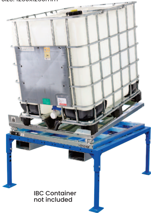
IBC Container not included